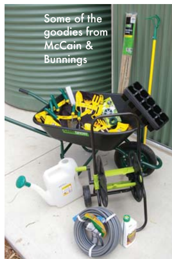
Some of the goodies from McCain & Bunnings