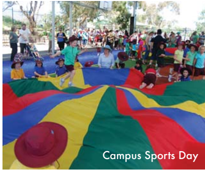
Campus Sports Day