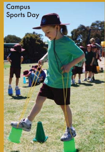
Campus Sports Day

TEAM SPIRIT - Yorke (Green) - 701 Eyre (Yellow) - 650 Murray (Blue) - 640 Flinders (Red) - 623