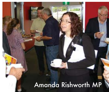
Amanda Rishworth MP

The Campus Band and Choir joined with combined Campus classes to entertain the visitors. The festivities were followed by a delicious morning tea.