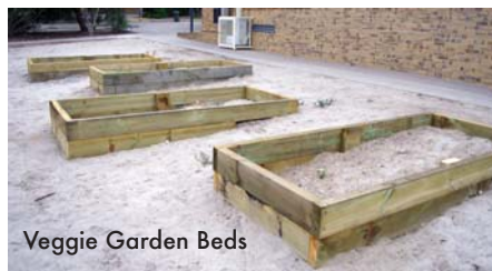
Veggie Garden Beds

Thanks also to our Campus partnership with Ucount, as the volunteers of the Men's Shed have been hard at work building the vegetable garden beds, ready for planting. It is hoped that Environmental Studies classes will begin planting some summer vegetables which could be ready for harvest early in Term 1 next year.