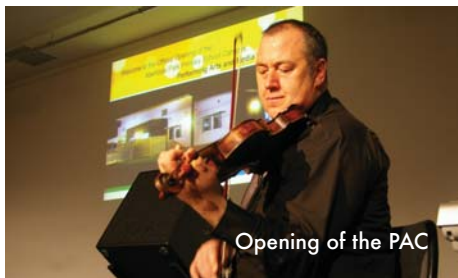
Opening of the PAC