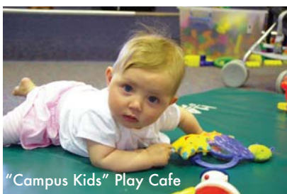
"Campus Kids" Play Cafe

Campus Kids is open to the community and it's a great way to socialise and meet new friends or chat to old ones. It's also an ideal way to find out more about any of the three Campus schools or the Campus pre-school.