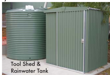
Tool Shed & Rainwater Tank

Thanks also to our Campus partnership with Ucount, as the volunteers of the Men's Shed have been hard at work building the vegetable garden beds, ready for planting. It is hoped that Environmental Studies classes will begin planting some summer vegetables which could be ready for harvest early in Term 1 next year.