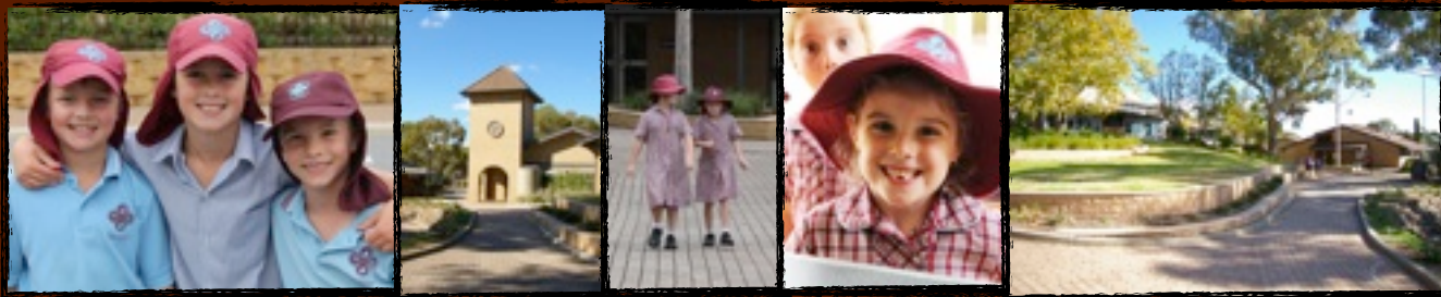
The Newsletter of the Aberfoyle Park Primary School Campus - Term 3 vol.2, 2012