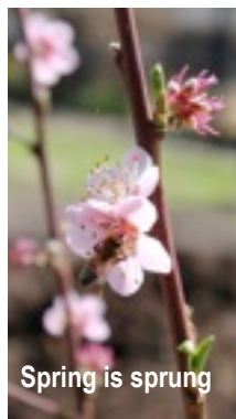
Spring is sprung

The Campus Sustainability garden is gearing up for great spring weather. Students have already planted out a range of vegetables that have yielded some bumper crops, and more is on the way. We've planted some new stone-fruit trees (already blossoming) and the veggies include, onions, lettuce, spinach, carrots and more.