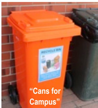
"Cans for Campus"

Shop locally and support the businesses that support us!