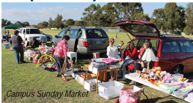
Campus Sunday Market

The Campus Sunday Markets are on again in 2013! The Events Committee have planned four more open-air markets for Term 1 of this year, with more to come depending on weather. The first one is set for Sunday 17th February and it's very easy to have your own seller's stall from the boot of your car. The cost is: Car $15/Car & Trailer $20, pay on entry. Pre-register before the day to get a $5 discount! Sellers set up from 6am to 8am. So clean out the garage or create some craft, just for sale.