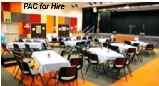
PAC for Hire

Did you know that the Performing Arts Centre and several other Campus buildings are available for private or community group hire? You can hire the PAC at very reasonable rates ( just $220 for a 5hr hire! ). Weekend or evening hires are always welcome. So the next time your business or club is looking for a venue for a quiz night, an AGM, a performance or to practice, call the Campus office 8270 3077 to find out more and make a booking.