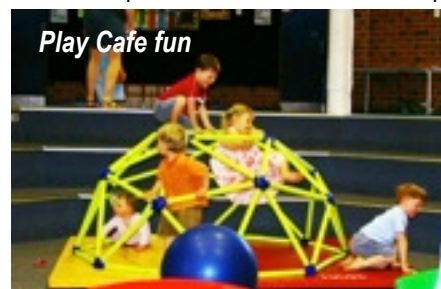
Play Cafe fun

"Campus Kids" Play Cafe is also looking for eager volunteers to assist each Tuesday and Friday. Both Cafe duties and people with Early Childhood training are required. If you are interested, please contact Philip on Mon/Tues or Fri at Campus on 8270 3077 .