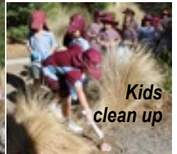
Kids clean up