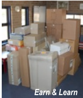
Earn & Learn

You might remember collecting sticker sheets at Woolworths last year? Well that grand total of over 90,000 points made Campus one of the highest achieving schools in this area and gave us a small mountain of items for the Campus community to enjoy this year. The boxes on the right are the goods that arrived in February from the 2012 competition.