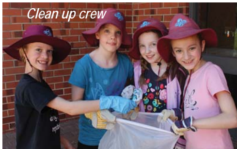
Clean up crew

For the first time, this year Green Day was held Campus-wide, with all three schools participating in environmental activities.