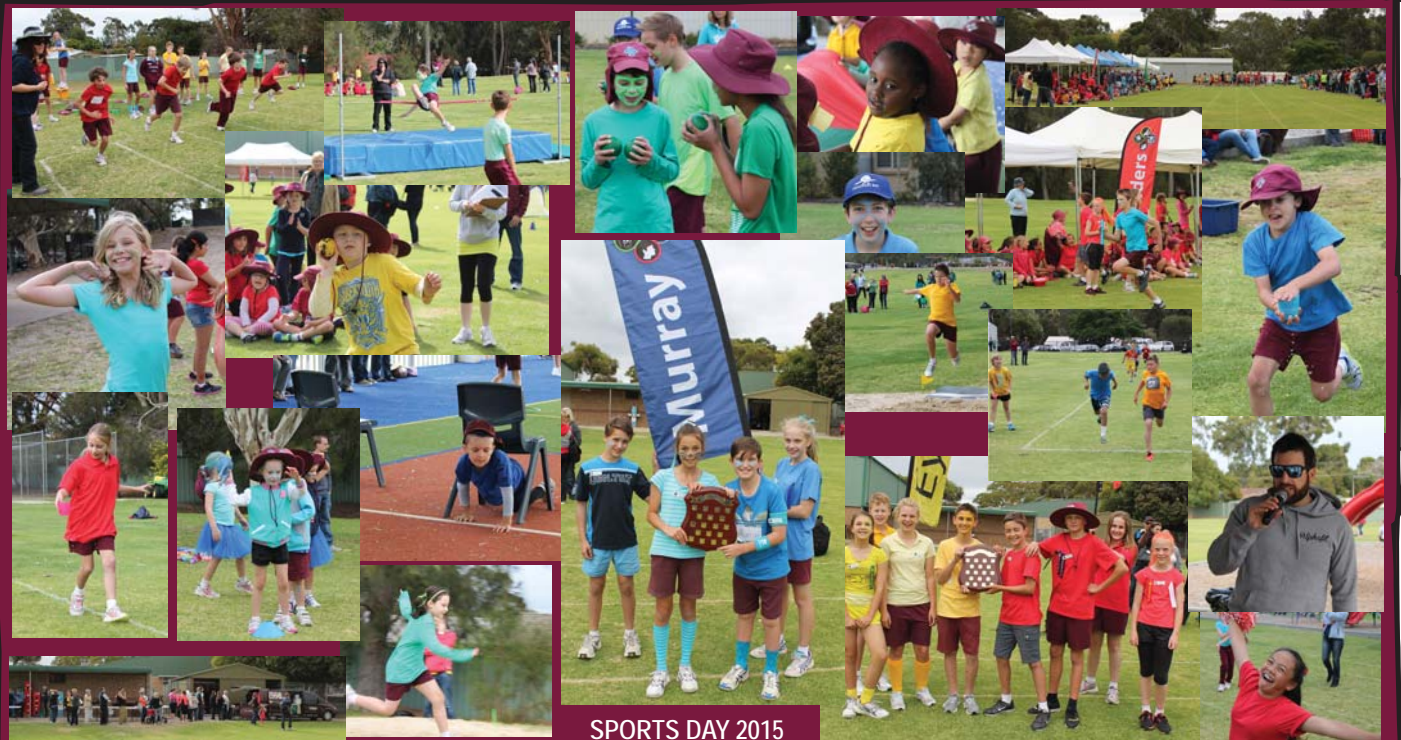
SPORTS DAY 2015

Campus Sports Day was a great success just before the end of Term 1 with the following overall results:- SPIRIT SHIELD - Equal 1st- Flinders & Eyre 372, 2nd Murray 331, 3rd Yorke 330. CHAMPIONSHIP SHIELD - 1st Murray 1596, 2nd Flinders 1524, 3rd Eyre 1473 & 4th Yorke 1472. Congratulations to all students who participated and had fun on the day.