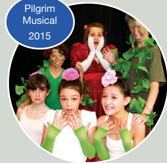
Pilgrim Musical 2015

A DVD of Pilgrim School's fun musical for 2015- Ants'hillvania is now available to purchase for just $10 from the Pilgrim office.